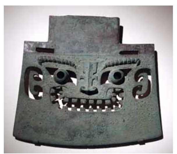
Bronze Battle Axe Shang Dynasty, excavated at Yidu, Shangdong Province.

The other great skill of the Shang was in carving jade (similar to the Maya in Central America.) These were used as sacrificial offerings to the gods and ancestors, in burial rites and as symbols of kingship. Jade had to be brought long distances, sometimes from Inner Mongolia and to have it was a sign of great wealth. They used cowrie shells for money - evidence of long-distance trade because cowrie shells came from the south coast of China, many miles away.